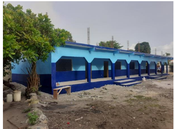
Construction and completed ground floor