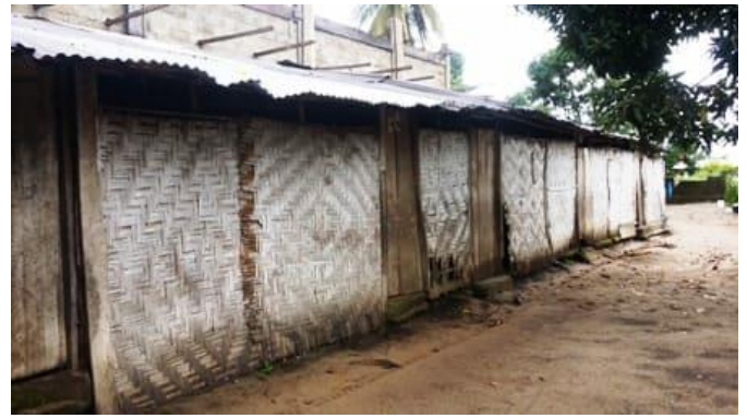
Wind-swept old classrooms