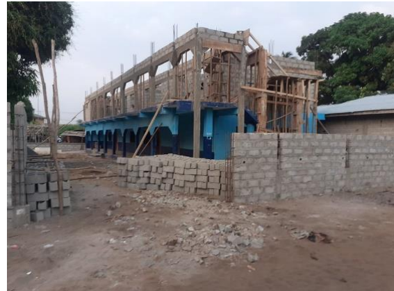
Construction in progress on first floor