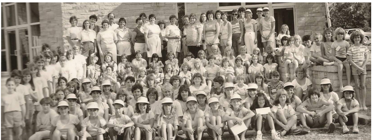
Eastern Rosebud Gathering – Rock Springs Ranch – July 18-20, 1985

Project was bath kits consisting of powder, lotion, soap, shampoo and bath towel for Keams Canyon Community Church; and bath kits consisting of bath size towel, wash cloth, soap, toothbrush, toothpaste, deodorant, comb for Bethel Neighborhood Center