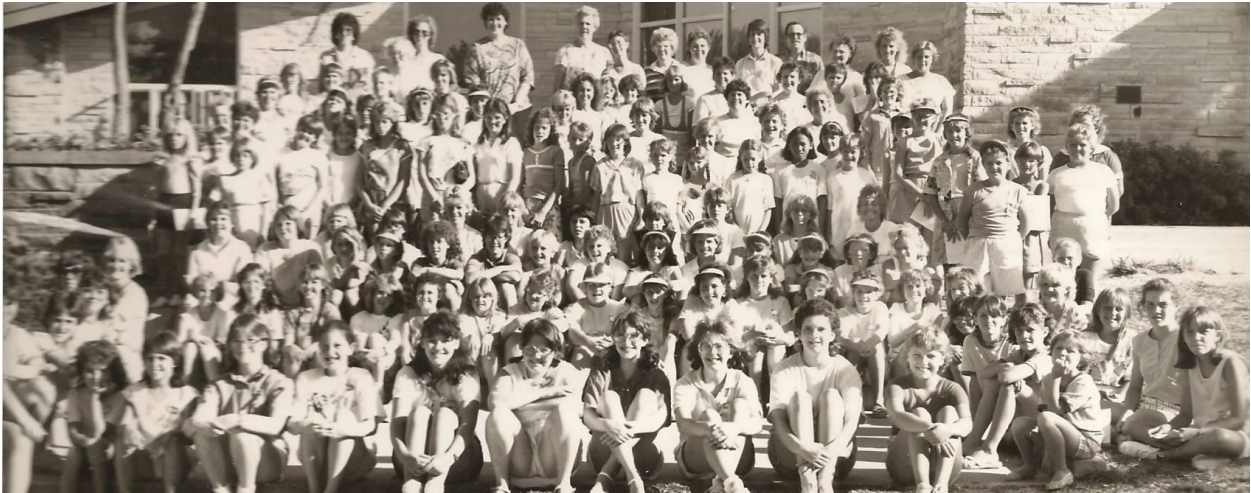
Central Region Rosebud Gathering – Rock Springs Ranch – July 17-19, 1986