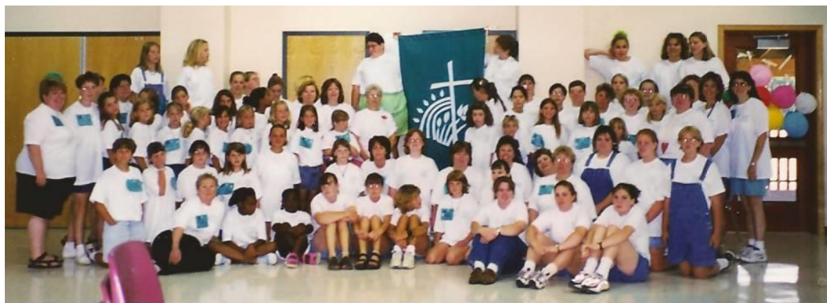
1999 House party at Cross Wind June 25-27

In 1998 all three AB GIRLS age groups met together for a combined Gathering/House Party for the first time at Cross Wind Camp and Conference Center in Hesston.