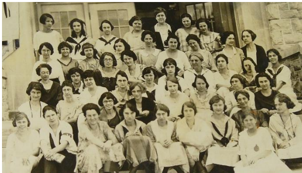
← W.W.G. House Party at Ottawa October 27-28, 1928

In 1941 the Children's World Crusade was discontinued, and the World Wide Guild took on a new name – the Fellowship Guild.